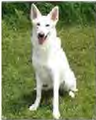
Ivy, Monique&Tracie Rally Novice Title

#477 10/12/16 GSDC St.Louis Rally Adv/Rally Excellent for RAE 9 th Leg #479 10/13/16 GSDCA Rally Adv/Rally Excellent for RAE 10 th Leg RAE TITLE #480 10/14/16 GSDCA Rally Adv/Rally Excellent for RAE Reserve Leg